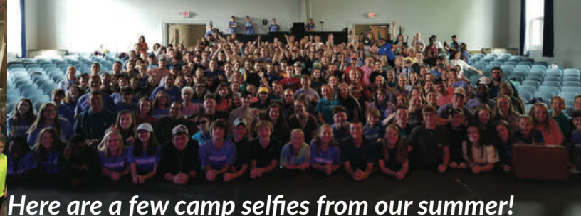
Here are a few camp selfies from our summer!