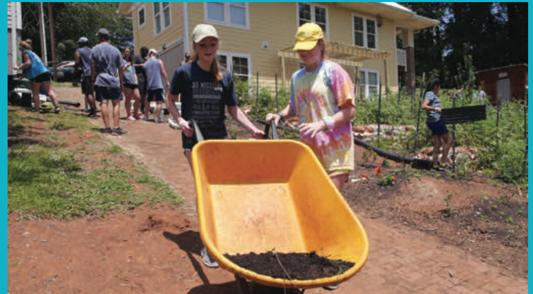
* PASSPORT missions campers at Annie's House.

At Passport we embrace community, both locally and globally, through education, advocacy, and action.